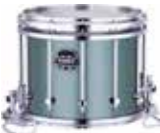
Twilight Sparkle (MI)