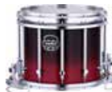
Scarlet Fade (RQ)