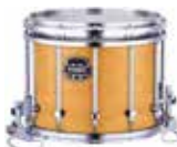
Desert Dune (DW)