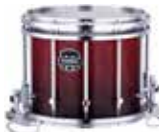
Magma Red (NV)