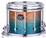
Ocean Sunset (JG)