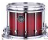
Rose Burst (HW)