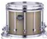
Gun Metal Grey (PG)