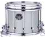
Diamond Sparkle (DT)