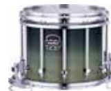
Teal Blue Fade (RJ)