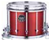
Tuscan Red (PA)