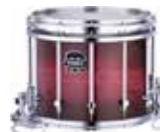
Tanzanite Burst (TI)