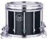
Black Galaxy Sparkle (VH)