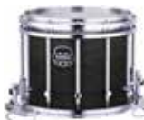
Satin Black (FB)