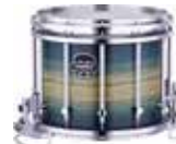
Rainforest Burst (ET)