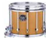
Transparent Copper (EW)