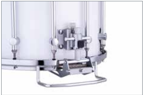
Quick Release Mechanism