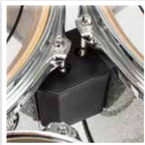
Drum to drum connection are made via the lug casings themselves, encased in a lightweight polymer housing.

The revolutionary patented Free Floating Lug Bridge mounting system suspends the drums from existing lug casing mounting locations, eliminating the need for additional drilling and extra hardware, as well as additional stress that typically impedes shell resonance.