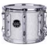
Silver Diamond Dazzle (CK)