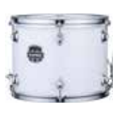
Gloss White (SW)