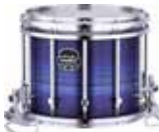
Night Sky Burst (VL)