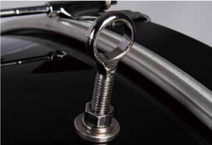
Adjustable eyebolt system