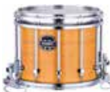
Amber Maple Burl (NL)

Shown with Standard Gloss Chrome hardware