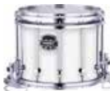
Satin White (RM)