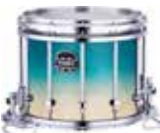
Aqua Fade (UQ)