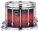
Brown Red Burst (VD)