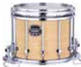
Natural Satin Wood (NW)