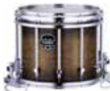
Gold Sparkle Burst (LW)

Shown with Standard Gloss Chrome hardware