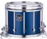
Blue Sky Sparkle (VI)