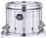
White Psicobloc Pearl (WD)