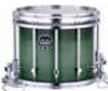
Emerald Burst (FG)