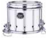
Gloss White (SW)

Shown with Standard Gloss Chrome hardware