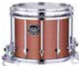
Blood Orange Sparkle (OR)