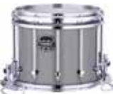
Iridium Silver (PD)