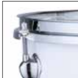
Gloss Chrome (CC)