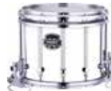
Polar White (PI)