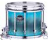
Exotic Azure Burst (PT)