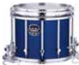
Midnight Blue (OD)