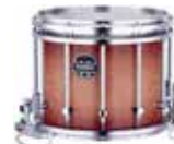
Redwood Burst (RA)