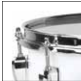
Gloss Chrome (CC)