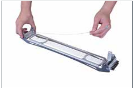
Individual Gut Adjustment