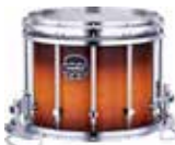
Exotic Sunburst (PO)