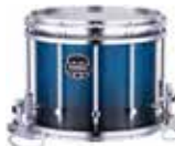
Photon Blue (BI)