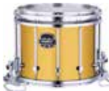
Sunflower Sparkle (YD)