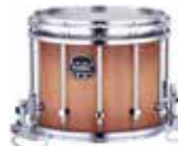
Peach Burl Burst (PW)