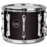
Gloss Black (DK)