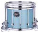
Aqua Blue Sparkle (VJ)

Shown with Standard Gloss Chrome hardware