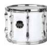
Gloss White (SW)