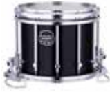
Gloss Black (DK)