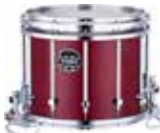
Crimson Red Sparkle (VM)