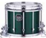
Brunswick Green (PQ)