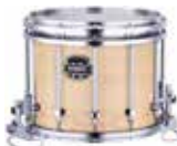
Natural Maple Burl (XN)