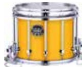
Tuscan Yellow (PM)