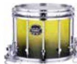
Sulphur Fade (UJ)