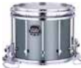
Steel Blue Metallic (VC)