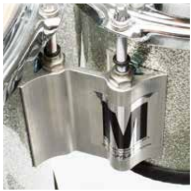
Shot drum connectors replace adjacent lug casings from the shot drum and the 1 or 2 drum from the primary array, depending on the configuration. Each allows for independent height adjustment of the shot drum and ensures a level playing surface.