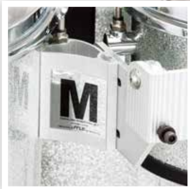
Connection of the outside drums to the backrail is accomplished through special lightweight aluminum integrated FFLB™ components that serve as both connector/spacer and lug casing.