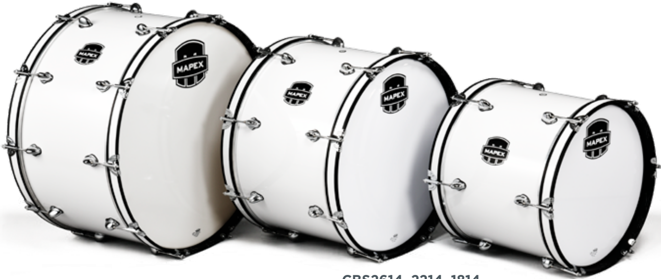
CBS2614, 2214, 1814

Contender bass drums are available in two configurations for use with either strap or carrier and six diameters with a choice of two shell depths to fill the needs of ensembles requiring various.