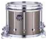
Copper Metallic (VX)