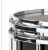
Gloss Chrome (CC)