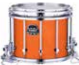
Glossy Amber (OG)