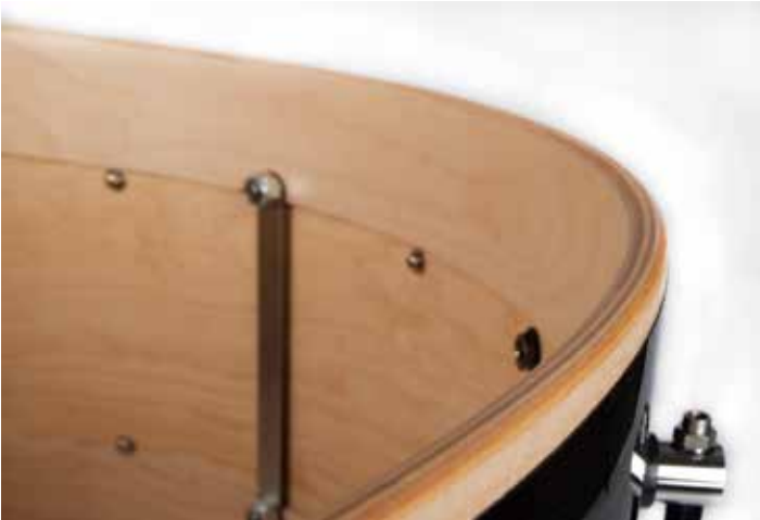
SONIClear™ bearing edges