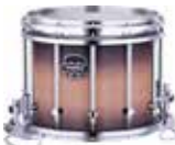
Exotic Violet Burst (PZ)