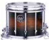
Caribbean Burst (CH)