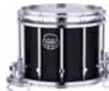
Piano Black (PB)