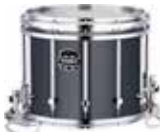
Dark Grey (GD)